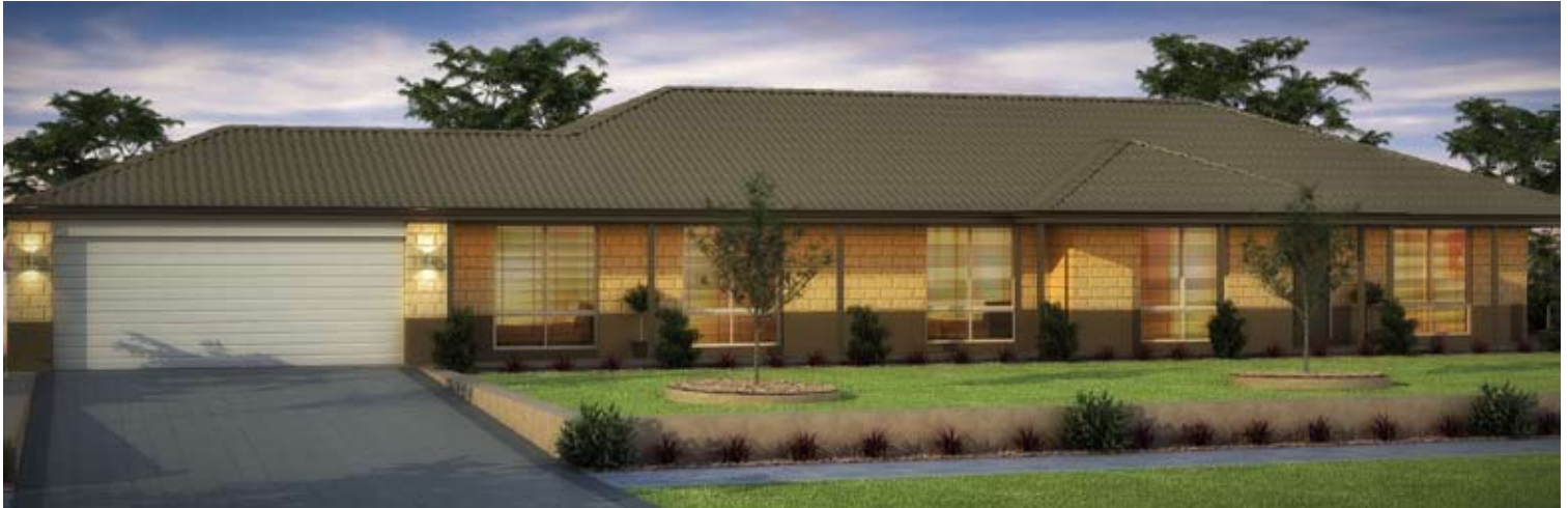
Elevation & Plan for illustrative purposes only