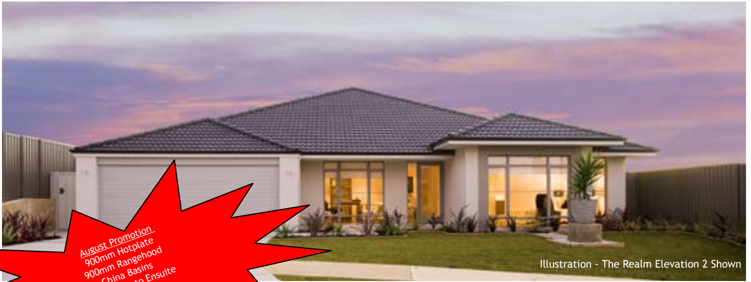
Illustration - The Realm Elevation 2 Shown

August Promotion 900mm Hotplate 900mm Rangehood China Basins Pivot Doors to Ensuite & Bathroom Double Power Points