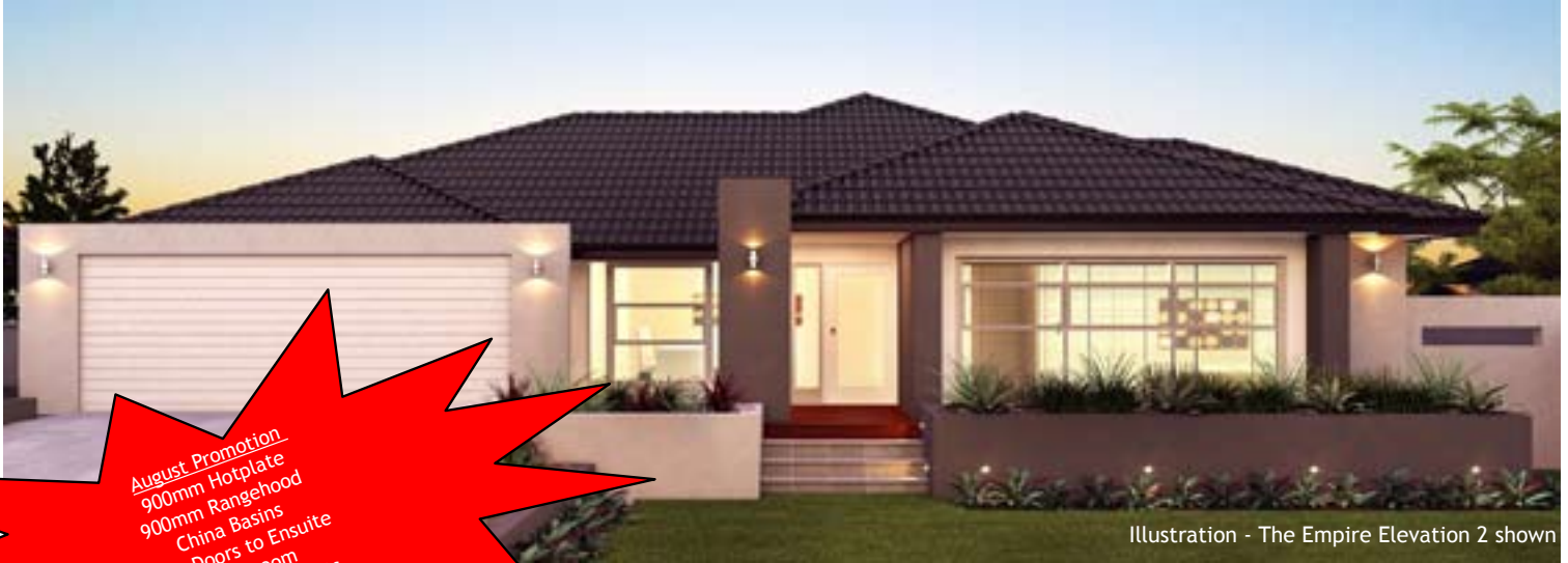
Illustration - The Empire Elevation 2 shown

August Promotion 900mm Hotplate 900mm Rangehood China Basins Pivot Doors to Ensuite & Bathroom Double Power Points