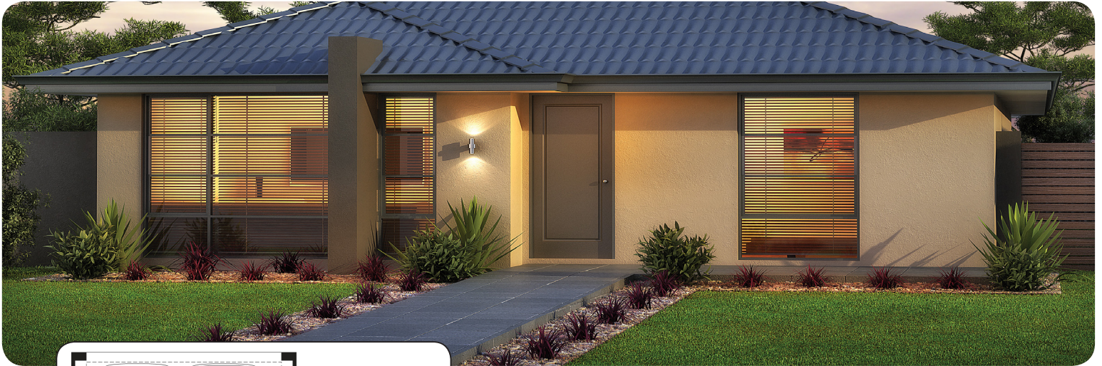
Elevation & Plan for illustrative purposes only