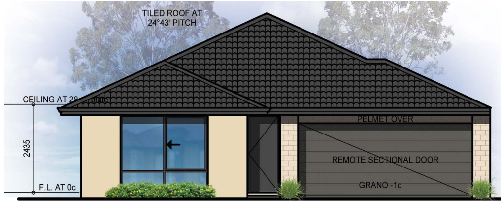
Render to front of master only