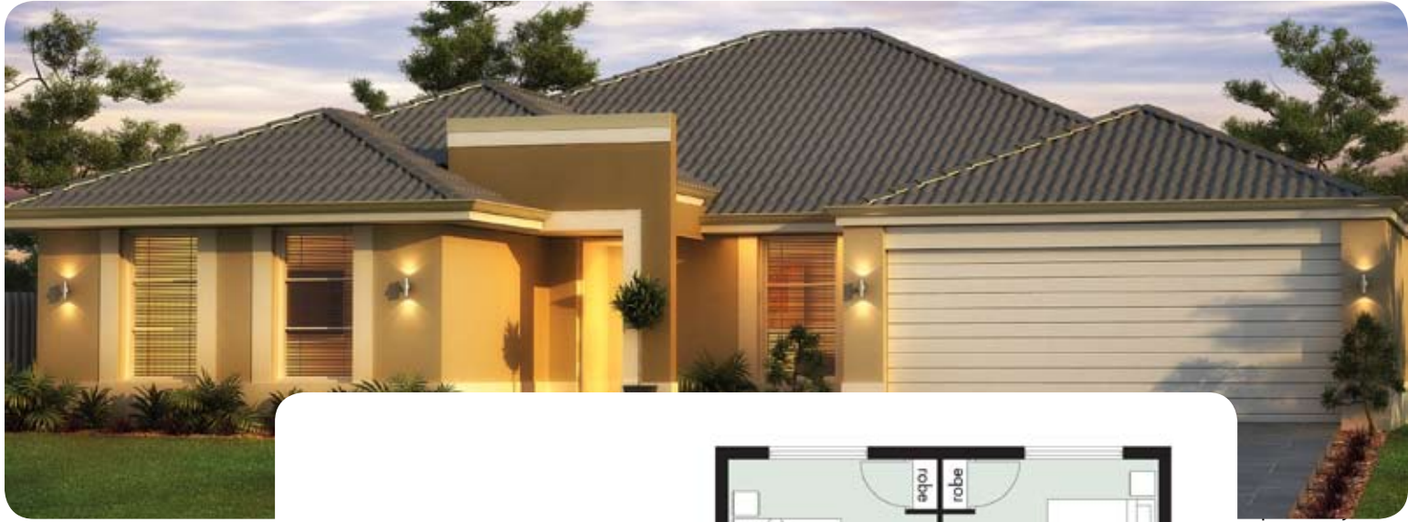
Elevation & Plan for illustrative purposes only